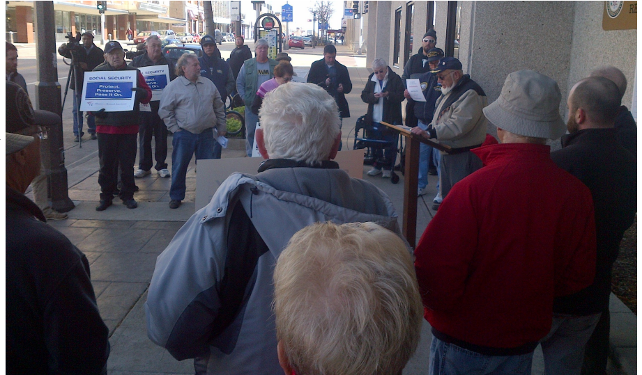
Citizens in Appleton Fighting for All Seniors and Against the Republican Agenda

Area residents joined with the Wisconsin Alliance for Retired Americans, Social Security Works, the Wisconsin AFL-CIO, the AFL-CIO Union Veterans Council, the Northeast Labor Retiree Club, Marinette Central Labor Council, Fox Valley Labor Council, Progressives United, the National Committee to Preserve Social Security and Medicare, and others outside Ribble’s office pointed to a new report on how the chained CPI will harm Wisconsin Veterans and Social Security beneficiaries.