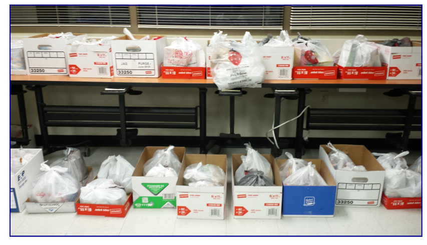
The meals waiting to be distributed.