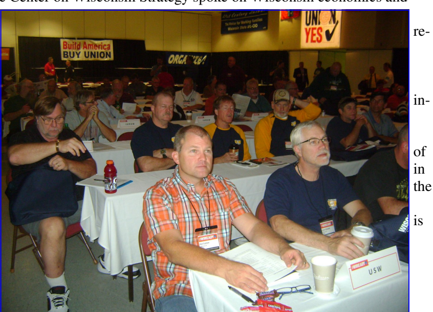
Assembly area with close to 200 delegates from various Unions throughout the state

<u>Visit:</u> www.youtube.com /badgerlodge