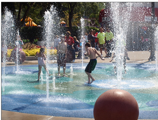
Let your children and grandchildren enjoy a day on the Summerfest grounds