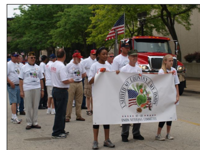
Memorial Day Parade with Union members and Veterans