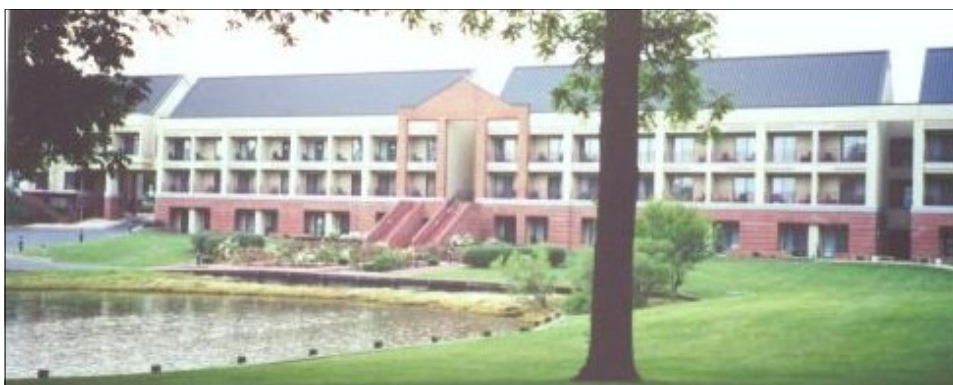
WWW Center, Placid Harbor, dorms and classrooms

If you do not have internet access you need to attend a Lodge meeting and let us know.