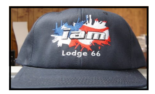
Caps available from Lodge 66 for $11.00 each.

There are two types of shirts: (1) with 'Fighting Machinist' on the back or (2) with a plain back.