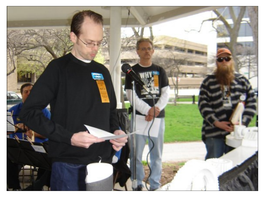
On April 28 we remember the more than 50000 workers killed on the job each year or who die of work related illnesses. In 2005 approximated 125 workers in Wisconsin never made it home from their job. Also read off were the names of those Wisconsin workers killed in Iraq each year. The above person is one of the many wounded soldiers from Iraq and he volunteered to read the names.