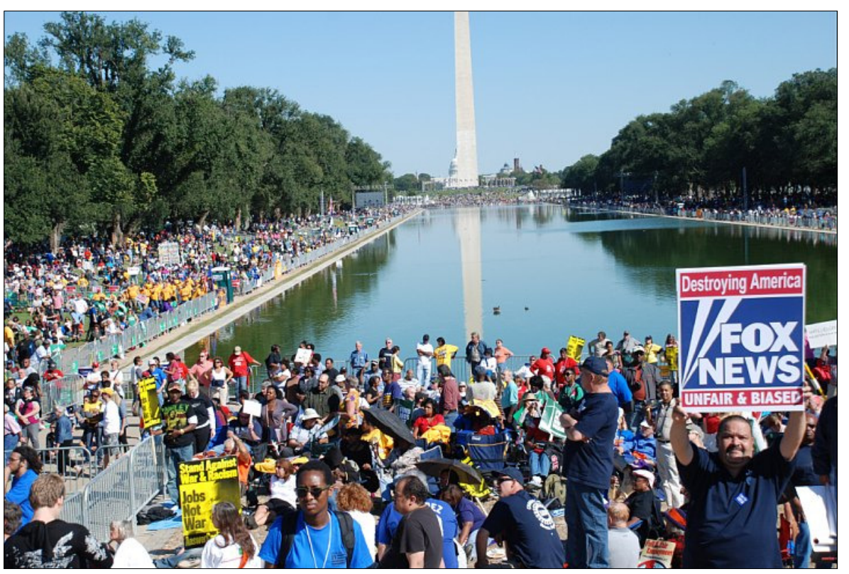
Source: material and picture from: <u>www.onenationworkingtogether.org</u> and <u>www.ilcaonline.org</u>