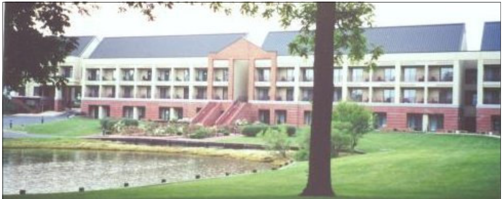
Placid Harbor, dorms and classrooms

To learn more the Lodge does have a 13 minute video on the Placid Harbor facility.