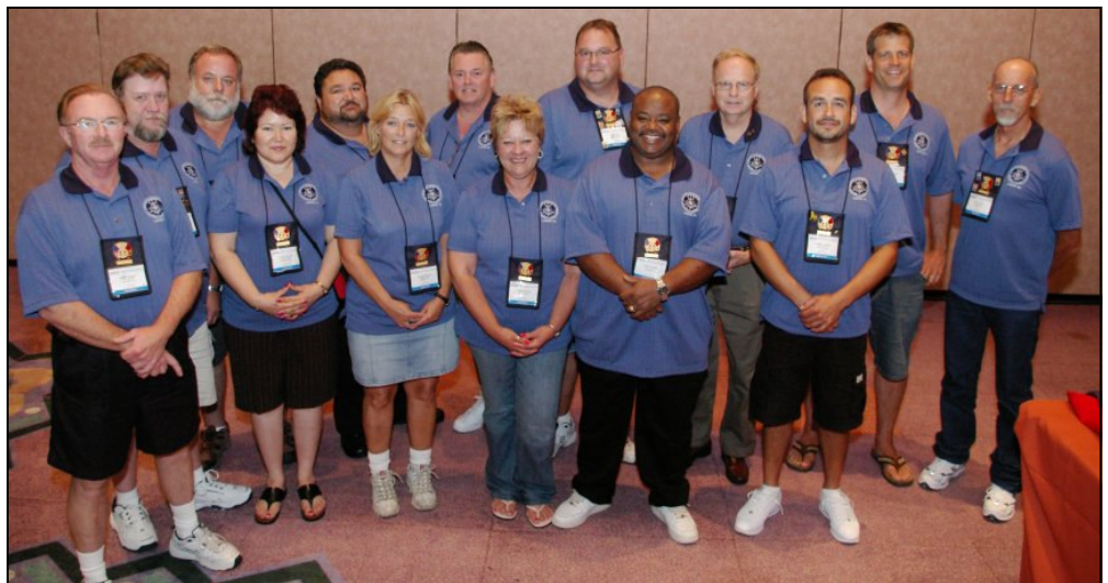
Lodge 66 Delegates to Convention: