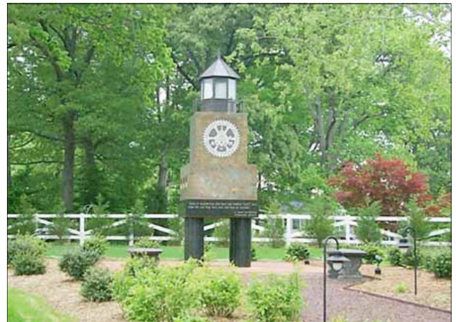
Our Memorial for members killed on the job.

On Friday we gave our presentation and received our completion certificates.