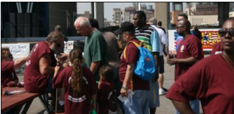
Laborfest and some of our members

I really enjoyed this and gained a lot of experience and I thank the Local for allowing me to get this positive experience.