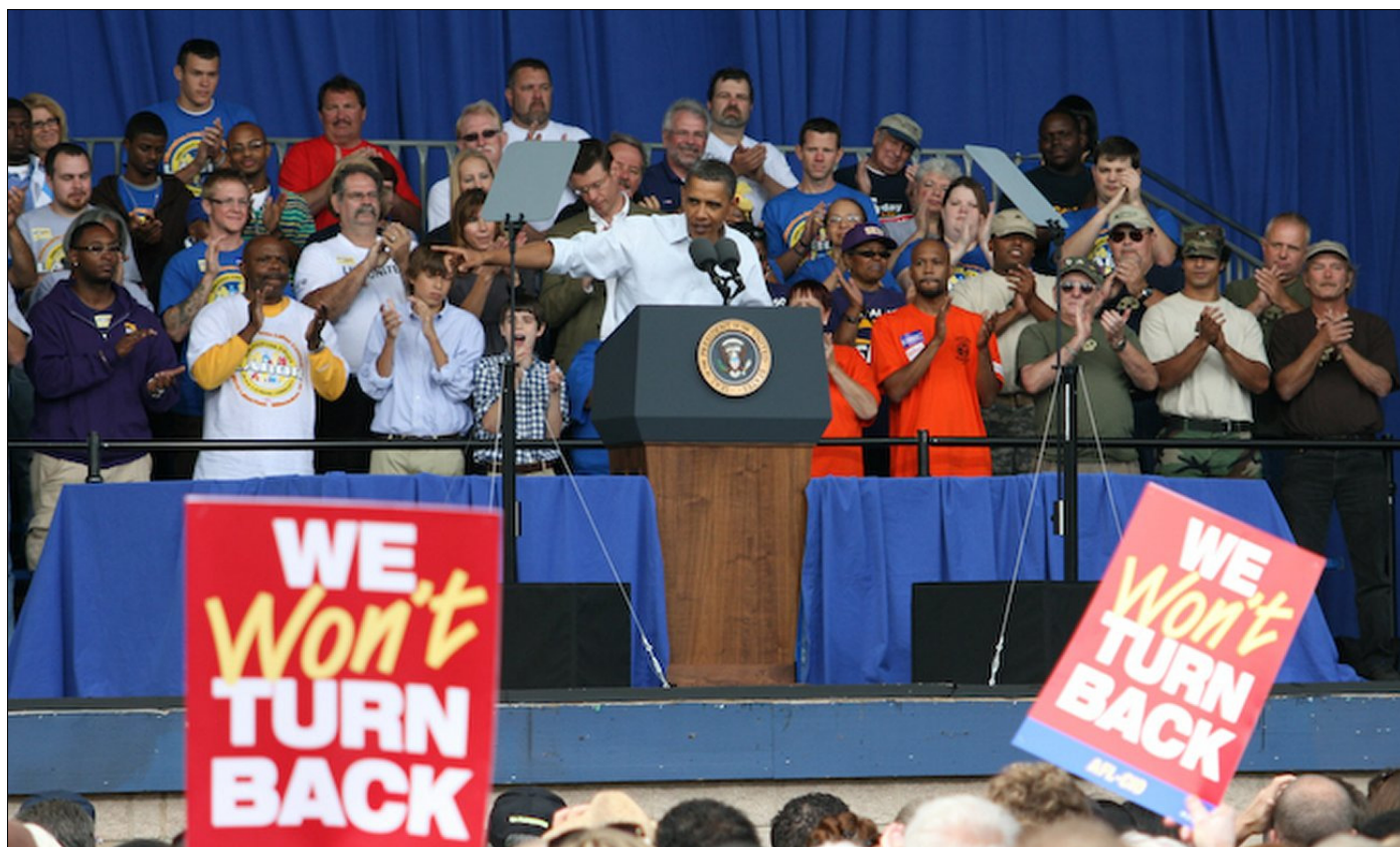
President Obama at Laborfest

Like a severely wounded person recovering from major surgery, our economy needs time to heal and rebuild its strength. Recovery won't happen without hard work and commitment to the change in management we voted for two years ago. A backwards step towards the policies of the past means that a lot more people will be going hungry for a lot longer.