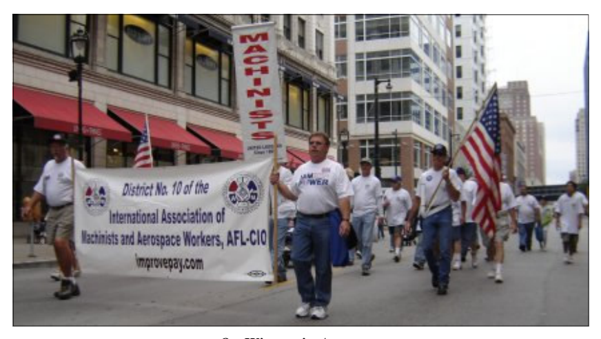
On Wisconsin Avenue