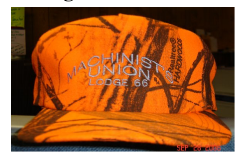
Lodge 66 for $15.00 each.