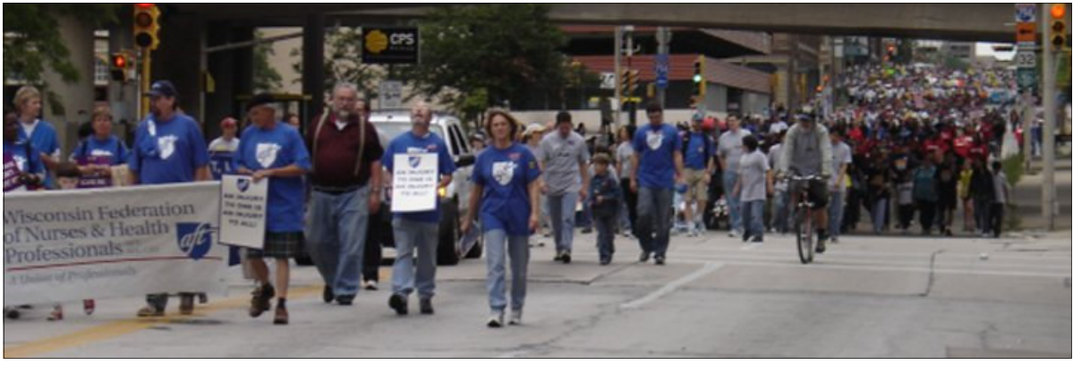
There were many workers, as there should be on any Labor Day event