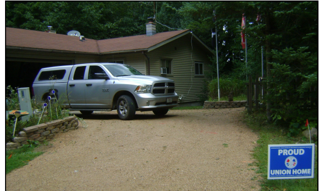
More Pic's page 5 & 6

A Union House in the northwoods and now an Union home. My Union membership started in October 1972 with Johnson Controls. It was a good job until they closed in 1997 and moved to Mexico. We were also an average shop and loved when the power house shops settled their contracts so we knew the area benefits and pay we would end