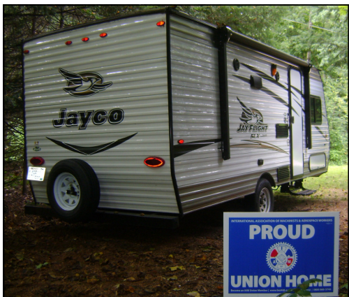
In case I really want to get away.