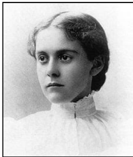
Alice Hamilton, 1893 Hospital Intern

Inspired by a science high school teacher in Fort Wayne, Alice enrolled at the University of Michigan Medical School in 1892. After graduation she completed hospital internships in Minneapolis and Roxbury, Mass.