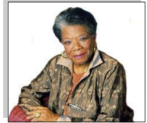
Maya Angelou (1928-2014)

I've learned that you shouldn't go through life with a catcher's mitt on both hands. You need to be able to throw some things back.