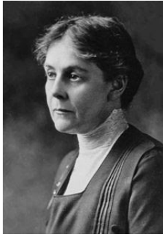
Pioneer of Industrial Medicine

Alice Hamilton was born in New York City on February 27, 1869. She grew up in Fort Wayne, Indiana and spent many summers with her family on Mackinac Island, Michigan.