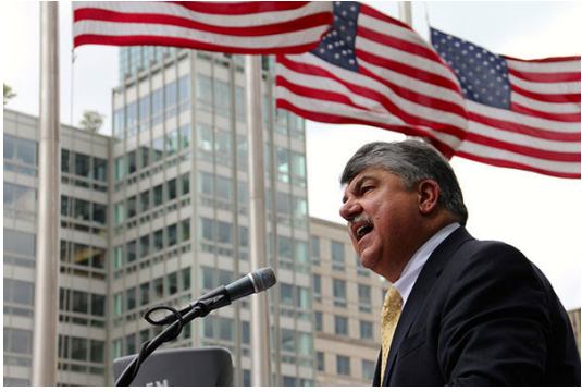
Richard Trumka, President AFL-CIO

Trumka noted that the draft agreement includes improvements on some issues, including: