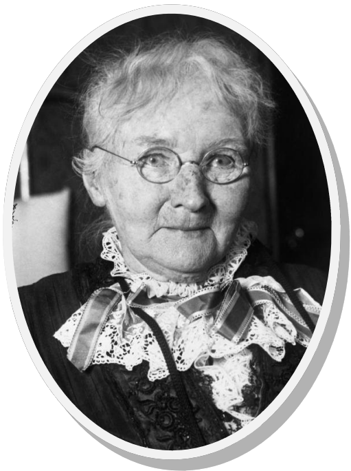
Mother Jones (1837-1930)