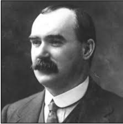
James Connolly (1868-1916)

***Born into an Irish working-class family in Edinburgh, Scotland he emigrated to the United States in 1903, already a well known Irish republican and socialist leader.