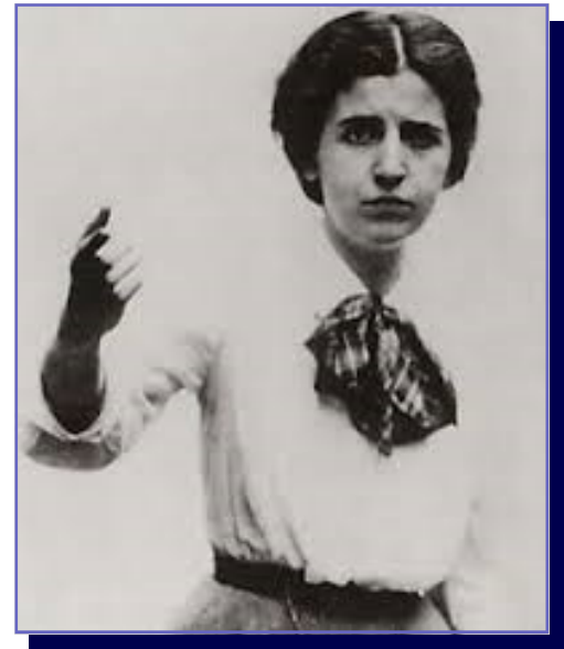
Elizabeth Gurley Flynn

The only people whose names are recorded in history are those who did something. The peaceful and indifferent are forgotten.