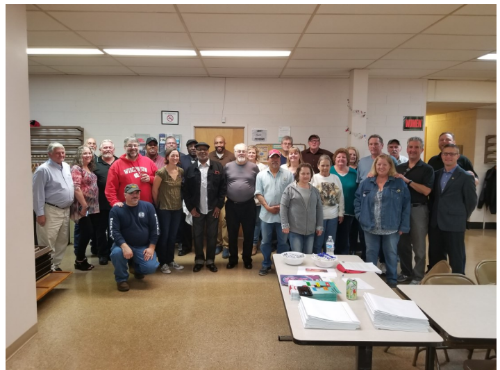
All of this years Badge Night honorees and their guests with the Lodge Executive Board and volunteers