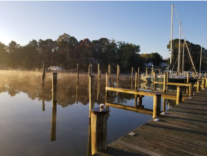
The view from Placid Harbor before a day full of learning

The week of October 13th I had the privilege of attending the Leadership II class at the William W. Winpisinger Center and I would like to thank the membership here at local lodge 66 for sending me for the week. Every trip to the W3 Center is full of the best training and if you have ever considered signing up for the Leadership program I highly recommend it.