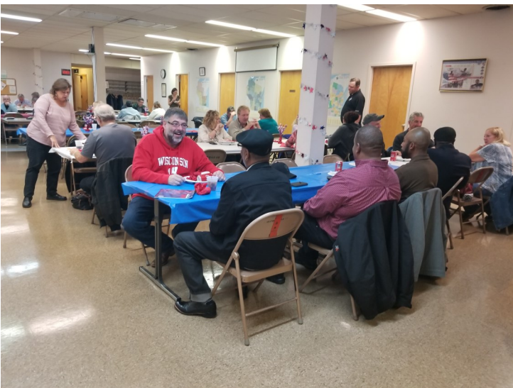
Lodge 66 Badge Night attendees enjoy the meal prepared by the Executive Board