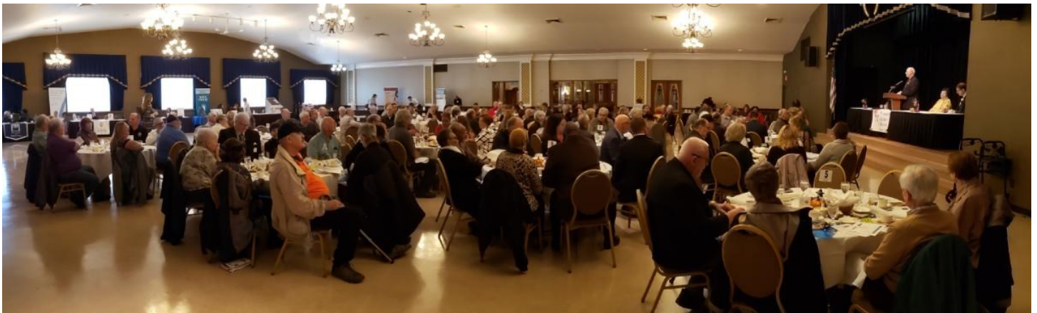
Panoramic view of the 2019 WIARA Power Luncheon at the Tripoli Shriners Taj Mahal Temple.