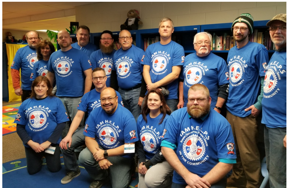
Staff of District 10 and members of Local Lodge 66 at the IAM H.E.L.P.S. Read to Me event at The Next Door Foundation in Milwaukee

District had held a book drive in the months leading up to the event and had collected around 1,500 books to give to The Next Door Foundation. Upon arriving on the morning of January 29th our volunteers were welcomed and given clear and concise instructions for the day. The folks at Next Door Foundation made sure all of our questions See IAM H.E.L.P.S. on pg. 3