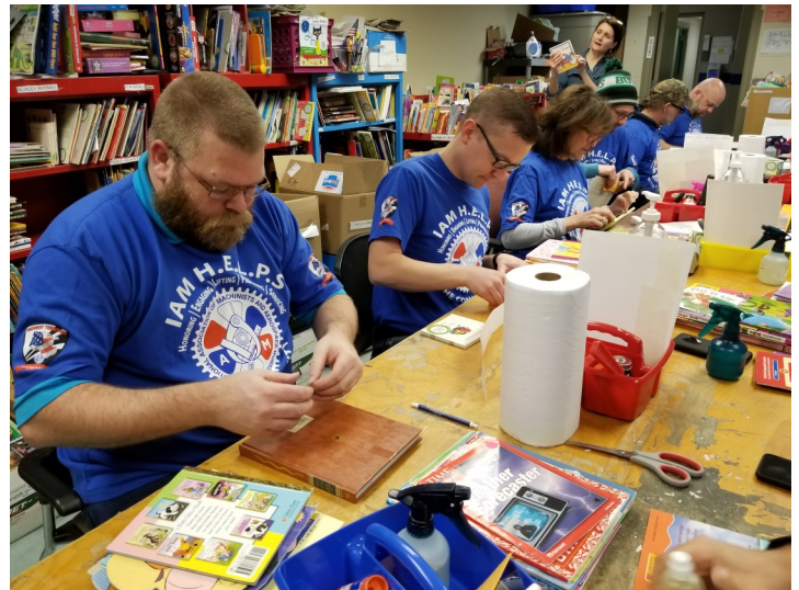
Volunteers work hard to prepare donated books for placement in The Next Door Foundations Library

After the last group of children left the library our group was head to the second phase of the H.E.L.P.S. event to clean, repair and prepare donated books for placement in the Next Door’s library. Once again the foundation had everything laid out for our group of volunteers and gave us excellent instructions for the work we were about to do. The group spent about an hour and a half going through stacks of books repairing ripped pages, rough spines and cleaning marker stains and shining covers up to ensure that each book that makes it in the Next Door library is ready for a young mind to pick up and read or take home.