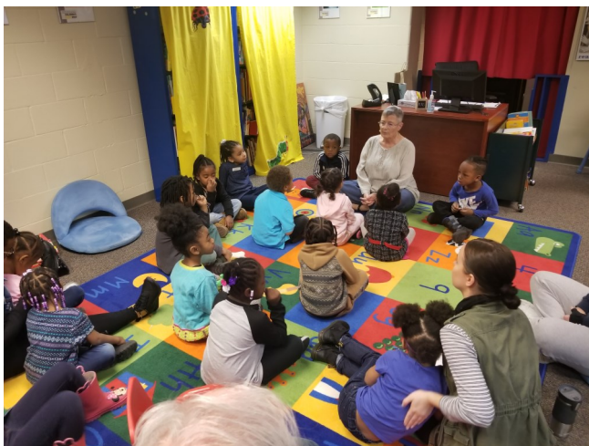
A group of 5 year olds listen to instructions before our volunteers read to them.

The first part of the day involved reading to the children in the program. The different age groups included 2, 3, 4 and 5 year olds. They were brought into the library where they sang the library song and said their names and introduced themselves. Next with the help of their teachers the children found a “friend” to sit with and read stories with. The children were well behaved and entertained as our volunteers not only read to them but also conversed about some of their favorite foods, colors and activities. Before each group of children left they were able to pick out a book from the library that they could take home and keep forever.