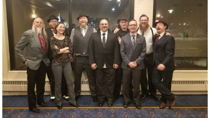
The members of Local Lodge 66 in attendance for the 59th Annual District 10 Installation Dinner

court race, the first ever member endorsed presidential endorsement by the IAM, A primary and Presidential election, a Grand Lodge Convention, a DNC national convention here in Wisconsin. Not to mention what is shaping up to be our biggest organizing year in District 10’s history. ”