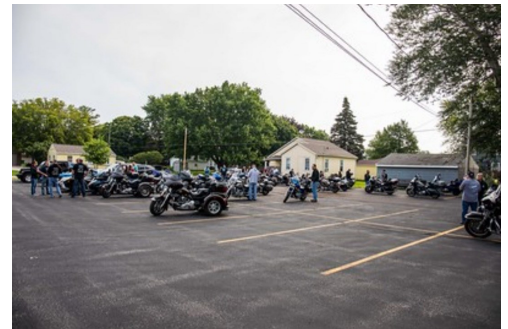
Riders gather for The Spirit of the Midwest Ride for Guides Charity Motorcycle Ride