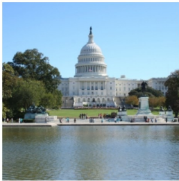
The Inflation Reduction Act includes health-care and energy-related provisions, a new corporate alternative minimum tax, and an excise tax on certain corporate repurchases of stock.

The Inflation Reduction Act, signed into law on August 16, 2022, includes health-care and energy-related provisions, a new corporate alternative minimum tax, and an excise tax on certain corporate stock buybacks. Additional funding is also provided to the IRS. Some significant provisions in the Act are discussed below.