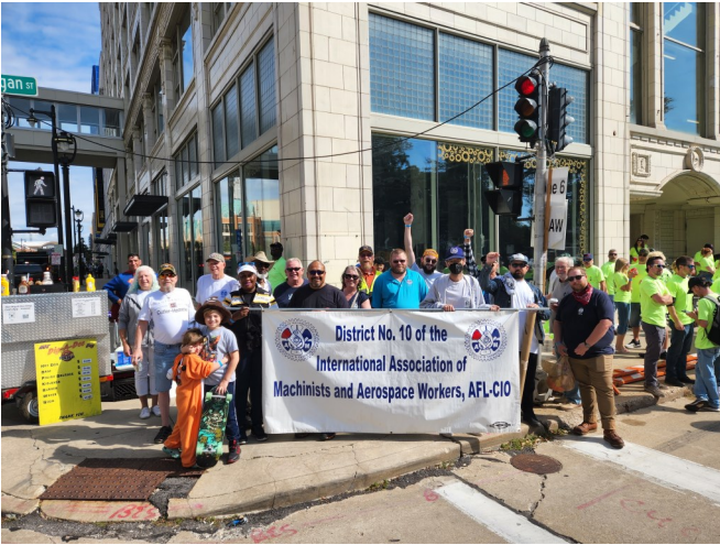
Group photo before the parade begins