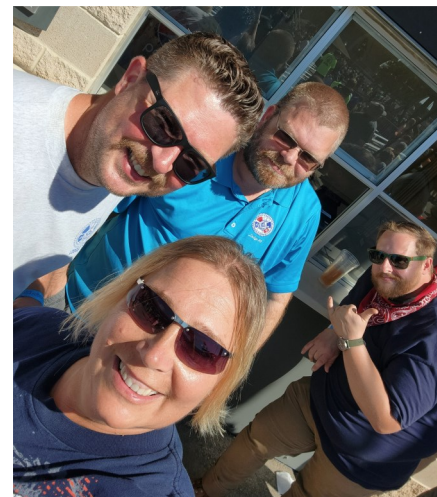
Laborfest was a blast after the parade