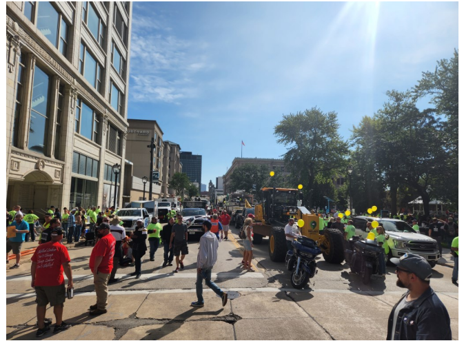
A great day for Solidarity