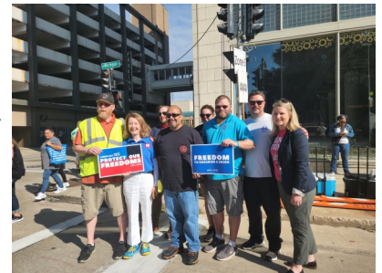
Members meet with AFL-CIO President Liz Schuler (above) and Labor Secretary Marty Walsh (below)

Overall Labor Day in Milwaukee was a great day filled with solidarity and a return to a normal celebration of our holiday.