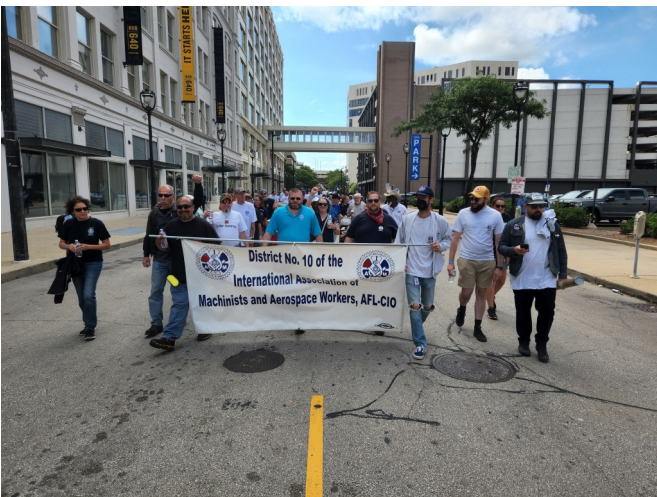
On the march!