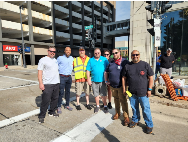
Lodge 66 members meet with Lt. Governor Mandela Barnes