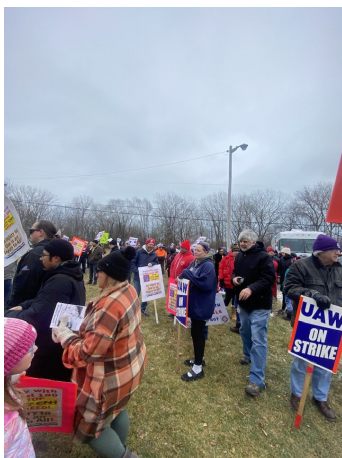
A look at many of the people that gathered to support UAW 180

We ended up at the Case plant where there was a large crowd of union members and supporters walking the picket line. To see their smiles and cheers as they seen us coming down the road with our signs in support of what they were fighting for was moving and I am glad that I was able to take part in this event!