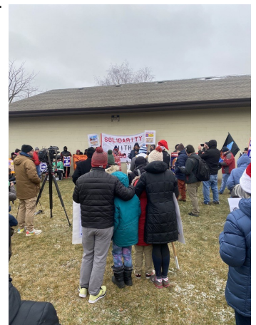
Supporters listening to the speakers