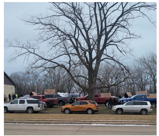
The vehicles ready for the car caravan