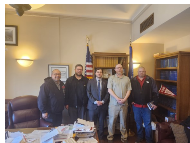
Delegates meet with Rep. Tip McGuire