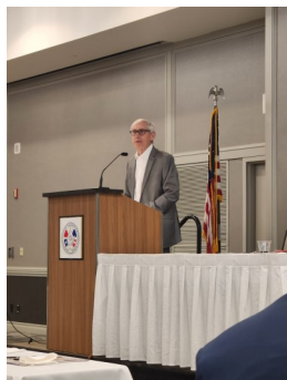
Wisconsin Governor Tony Evers addresses the Wisconsin State Council of Machinists

All in all it was a very informative and rewarding experience attending the 2023 State Council of Machinists and I thank the membership for sending me. I look forward to continuing the relationships we've already established and making new ones with those we weren't able to.