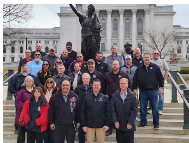
Delegates in front of the Capitol