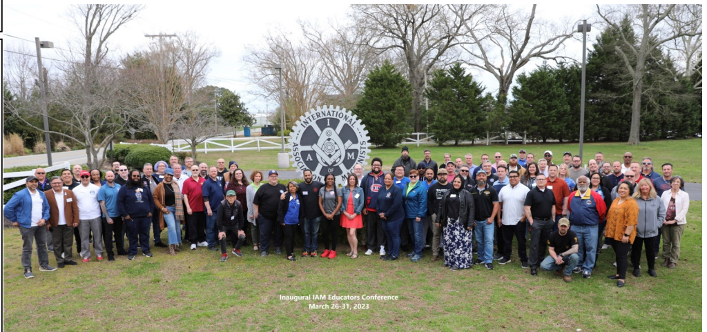
Delegates from the IAM's Inaugural Educators Conference gather for a picture at the William W. Winpisinger Center

From March 26 th through the 31 st the International Association of Machinists held its first Annual Educators conference at the William W. Winpisinger Center in Hollywood Maryland. The weeklong event drew over 75 educators across the United States and Canada and gave each educator in attendance a wealth of knowledge to bring back to their locals.