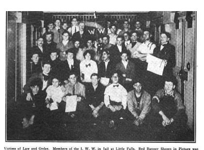
Caption reads "Victims of law and order. Members of the IWW in jail at Little Falls. Red Banner shown in picture made in cell"

At the time it was the longest strike as a result of the Jackson Bill and was the largest strike held in New York State. While it was a win for worker pay there was still housing issues for the immigrant workers. After the contract dispute was settled The State Department of Labor investigated the living conditions of the workers and found them unsatisfactory. A "Clean Up Week" to improve the living conditions in the immigrant part of town was held and The Phoenix Mill also constructed some new homes for workers.