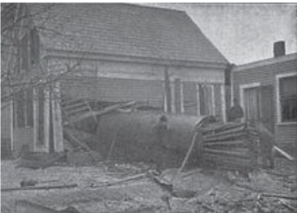
The boiler where it came to rest in a neighboring home

Everything seemed to be going to plan that morning but there was a problem with the older boilers design. The boiler was designed with a lap joint shell which had a joint of two pieces of steel that overlapped each other. While cracking within a boiler is expected and repairable, cracks under these joints would be nearly impossible to detect. That is exactly what caused the boiler to explode that morning, as the boiler tore away and shot through the factory, through Rockwell's own home and ended up in the house next door.