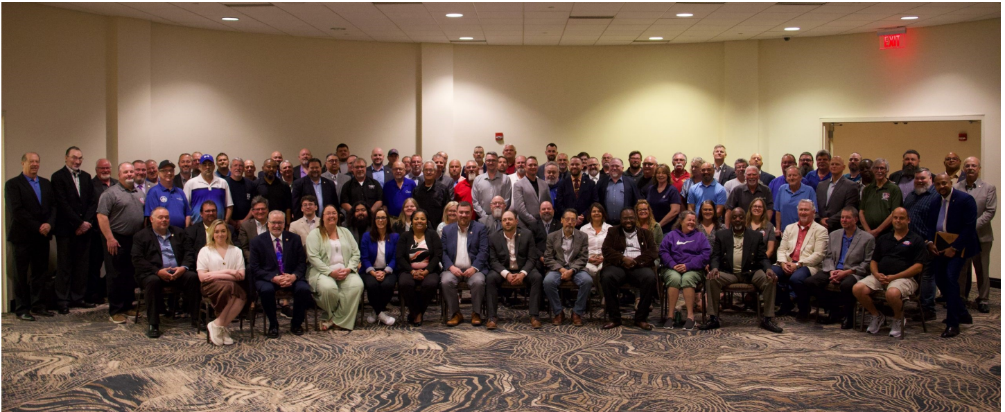
Group photo of delegates to the 2024 Midwest States Council of Machinists